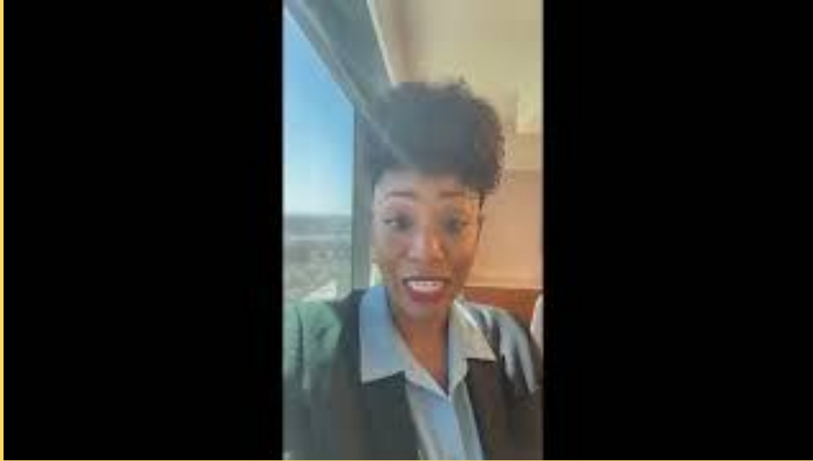
VIDEO: Malia Cohen, State of California Controller